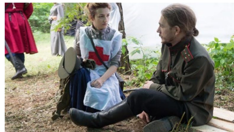
A nurse checks on a wounded soldier in Manchuria.

Regulations, or at least guidelines, affected even social play. For example, if you were sitting close to someone on the train for more than ten minutes, you had to tell them your life story or political position. If you ate from the buffet, you had to discuss a hot topic with someone. If you sat down to